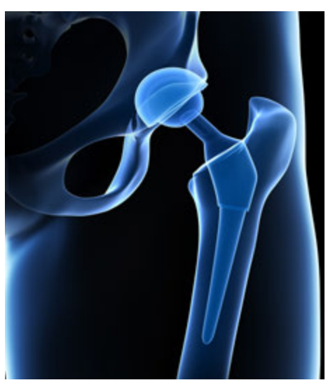
Many patients are not ready to drive for 3-4 weeks after surgery.

Studies have shown that not all patients require formal therapy after surgery in order to be successful, but we do find that therapy is an excellent way to make controlled progress. Early after surgery, physical therapy may come to your house, but as soon as you are mobile, we prefer that you go to an outside facility for your physical therapy. We find that leaving the comfort of your home for therapy eliminates some of your household distractions to allow you to focus on your exercises. You may need someone to drive you to your physical therapy appointments for the first few weeks.